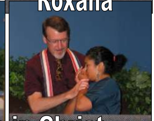
NEW Life in Christ