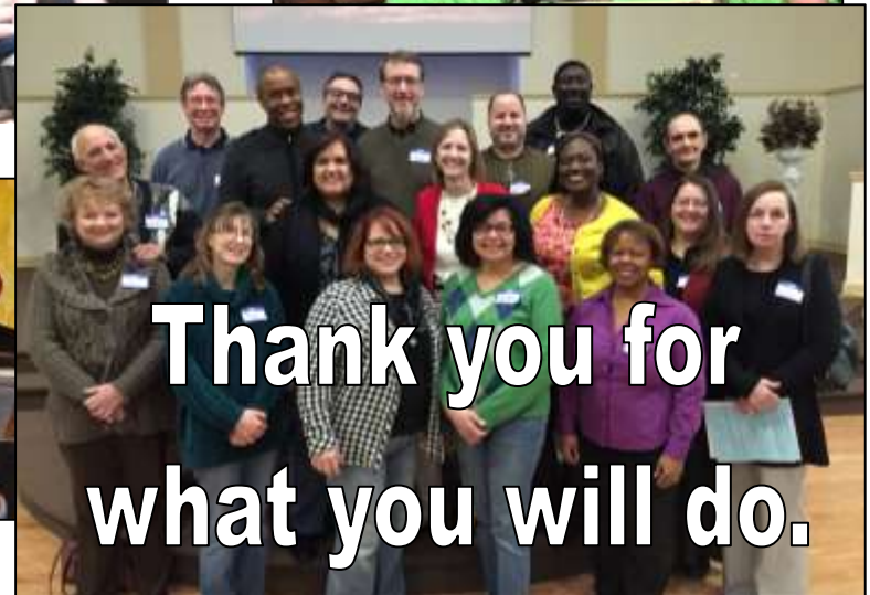
Thank you for what you will do.