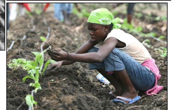
Leaving the Streets Learning of Christ